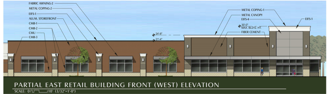
PARTIAL EAST RETAIL BUILDING FRONT (WEST) ELEVATION