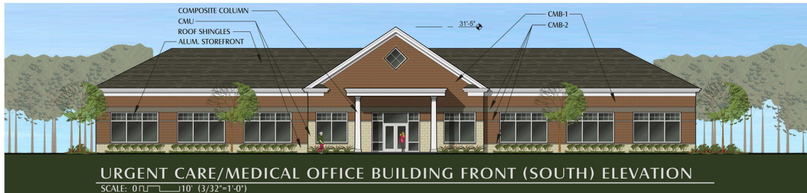
URGENT CARE/MEDICAL OFFICE BUILDING FRONT (SOUTH) ELEVATION