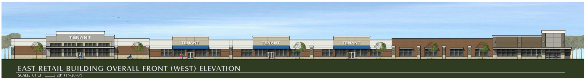
EAST RETAIL BUILDING OVERALL FRONT (WEST) ELEVATION