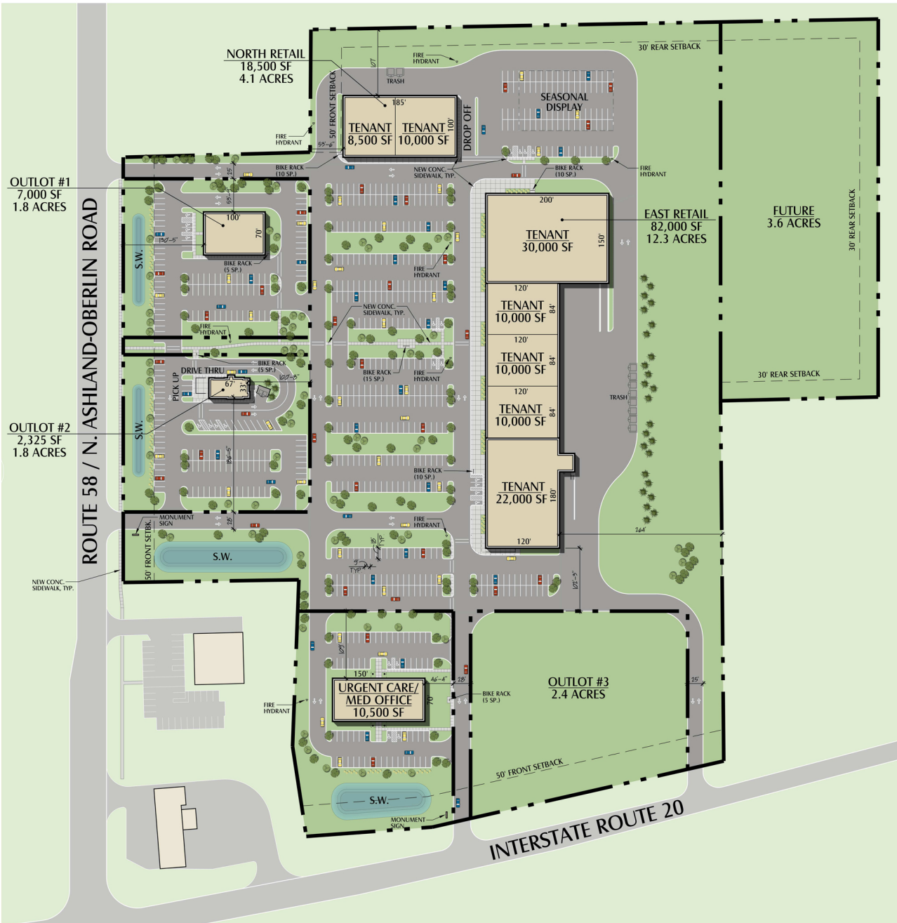
SITE PLAN SCALE: 0" = 75'

NOTE: PROPOSED FIRE HYDRANT LOCATIONS TO BE APPROVED BY OBERLIN FIRE DEPARTMENT